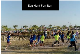
Egg Hunt Fun Run