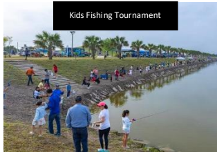
Kids Fishing Tournament